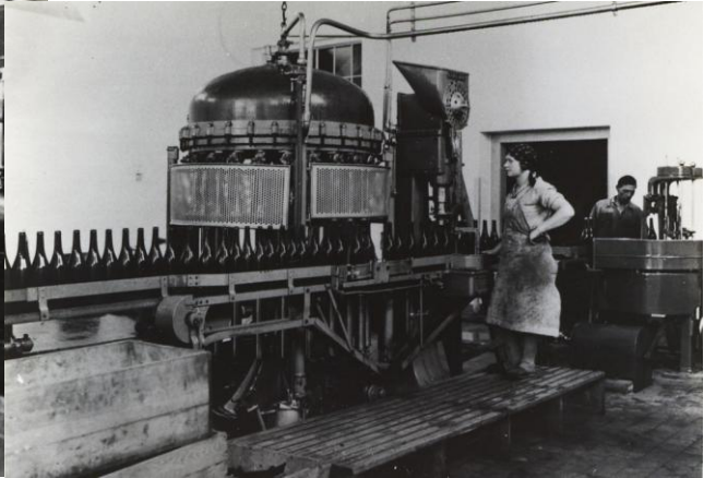
Bottle filling

After the revolution in 1989 breweries and malt houses were returned back to its previous private owners during restitution. Family breweries and mini-breweries were formed and various special beers with various flavours are brewed, like apple, pear, pineapple, banana, plum, caramel, ginger, prune, raspberry, cherry, honey, even hemp.