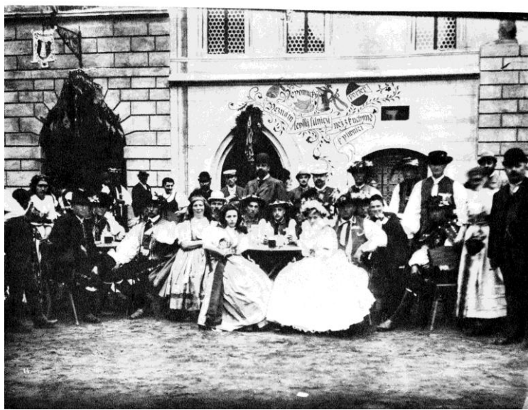
Peasant wedding under the motto: “I do not know better road than from kitchen to the beerhouse”

Music: Many of traditional or popularized tunes and drinking songs arose throughout the history and are even in country or rock music (like Pivečko by the band Orlik, Jarošovský pivovar by Argema or a traditional Co jste hasiči , or in songs from bands like Tři sestry , Alkohol or Brutus ). With beer we can meet also in classical works like in operas from Bedřich Smetana (1824 – 1884) who was actually born and grown up in a brewery.