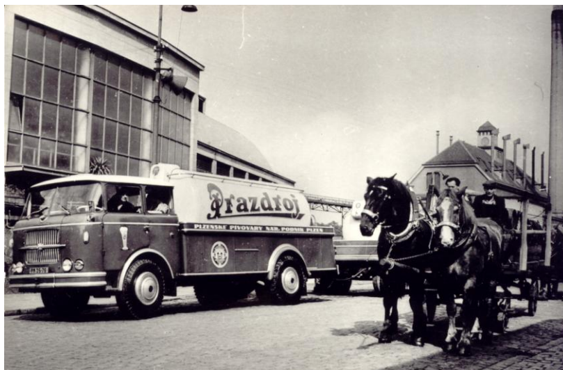
Two worlds: automobile transport and horse waggon

The brewing was fiercely interrupted by both world wars. Many breweries were destroyed or severely damaged. After communist regime took over the power (1948), breweries were nationalized and their production centrally planned. Majority of finance was invested into heavy industry, therefore breweries and malt houses had to use the old equipment. Despite that they were able to supply our market sufficiently and represent then Czechoslovakia in the world.