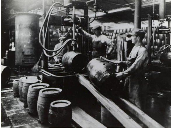
Barrel filling