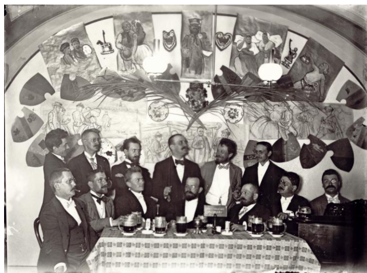
Paseka table party (Brewery Museum Pilsen)

In 1840's where also pubs in countryside turned to patriotism pubs were scenes for migrant theatrical companies, patriotic feasts and other cultural or social events. In the 2 nd half of the 19 th century pubs became also centres of political opinions and where even political parties were founded (like the Social Democratic Czechoslovak party in Austria in Prague Kaštan restaurant on the 7 th April 1878) and table societies begun to meet to create some work and discussed it with fellows or critics. An artistic table society called Mahabharáta became famous outside its region, originated from meetings in the St. Thomas brewery in Prague district Malá Strana (Lesser Town). Its members were artists like Jakub Arbes (writer and journalist), Mikoláš Aleš (painter), Jaroslav Kvapil (poet and dramaturg), Eduard Vojan (actor), Jaroslav Vrchlický (poet), Karel Matěj Čapek-Chod (writer and journalist) and others.